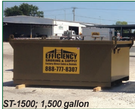
ST-1500; 1,500 gallon