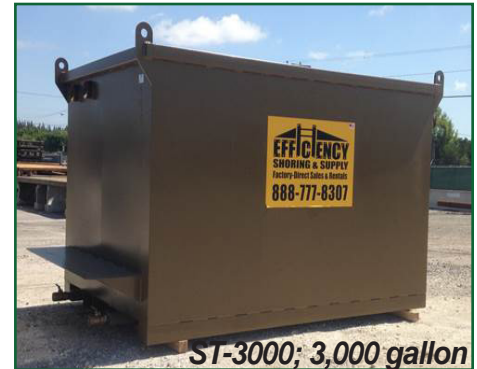
ST-3000; 3,000 gallon