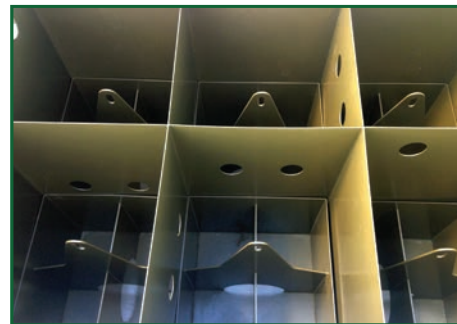
Six baffle chambers contain removable trays for silt removal