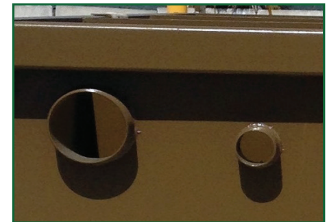
3 and 6 in. inflow and discharge ports